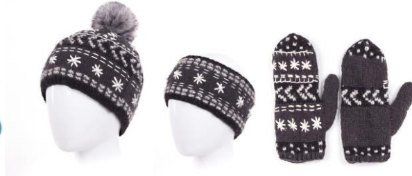
Wool Beanies, Headbands & Mitts