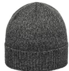
Ribbed Cuff Beanie Recycled