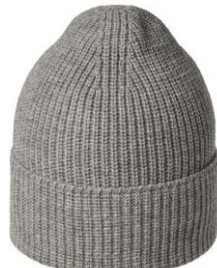
Chunky Beanie Recycled