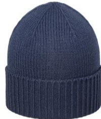
Ribbed Cuff Beanie Solids & Marled