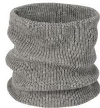
Chunky Loop Recycled