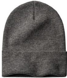
Cuffed Beanie Acrylic & Merino