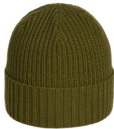
Ribbed with Cuff Beanie Recycled