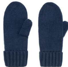
Chunky Mitts Solids & Marled