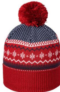
Snowflake Pom Beanie Recycled