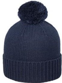
Ribbed Cuff Pom Beanie Solids & Marled