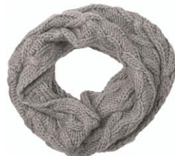
Cable Single Loop