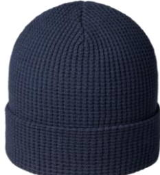
Waffle Beanie Acrylic & Merino