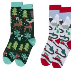
Holiday Woodland & Tree Hunt Socks* Organic Cotton