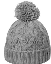
Cable Cuff Pom Beanie